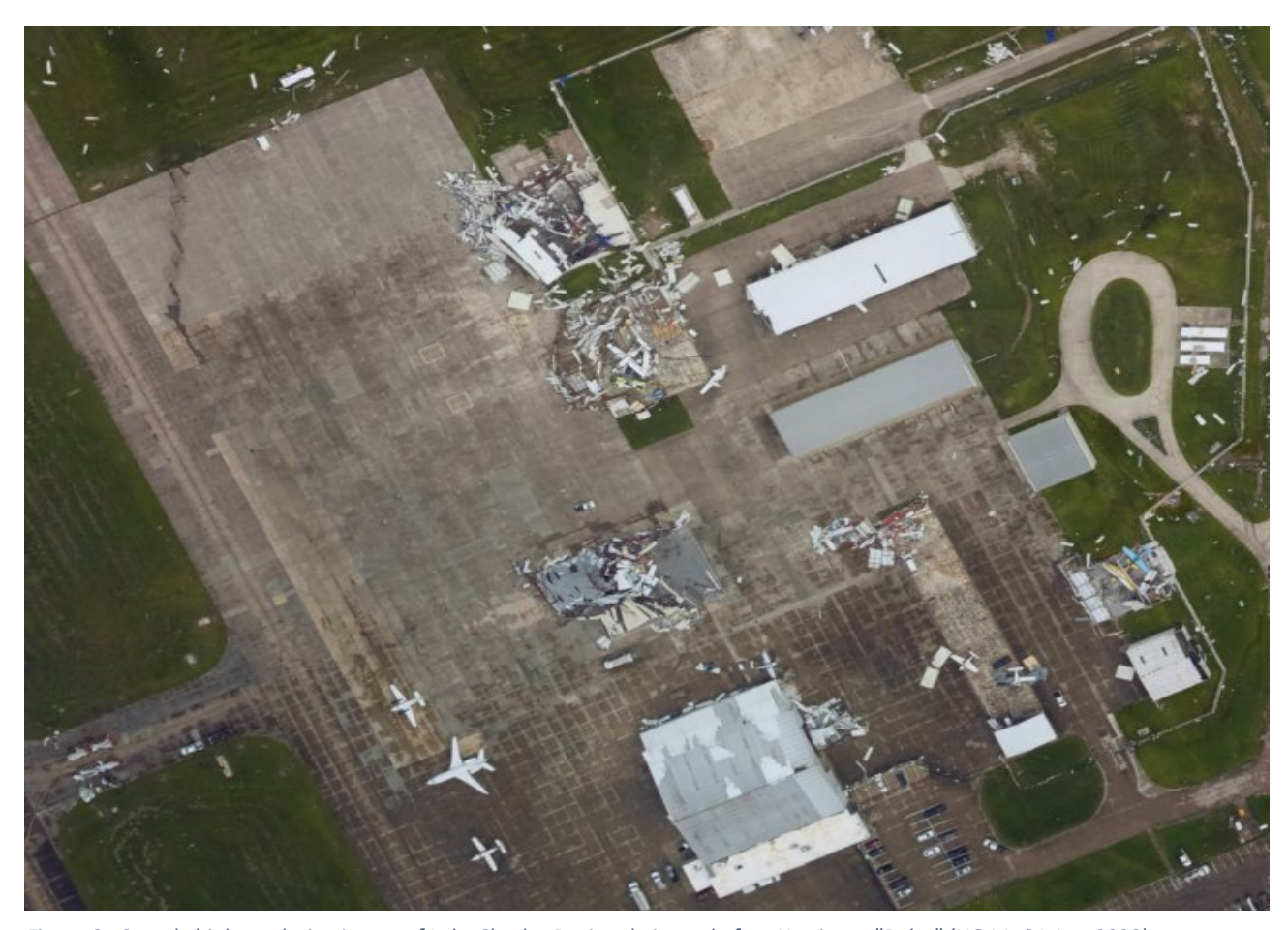
Figure 3 - Sample high resolution image of Lake Charles Regional airport before Hurricane "Delta" (NOAA 31 Aug 2020)

In addition to marine hull and energy offshore assets, Skytek React has prepared a database of high-resolution imagery that maps damages associated with Hurricane "Laura" and in collaboration with several leading providers will be in a position to provide an analyze of additional damages related to the Hurricane "Delta".